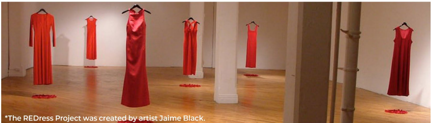
*The REDress Project was created by artist Jaime Black.

The REDress Project* focuses on the issue of missing or murdered indigenous women across North America. It is a powerfully emotional installation art project in response to this critical issue. The project has been installed in public spaces throughout the United States and Canada as a visual reminder of the staggering number of women who are no longer with us.